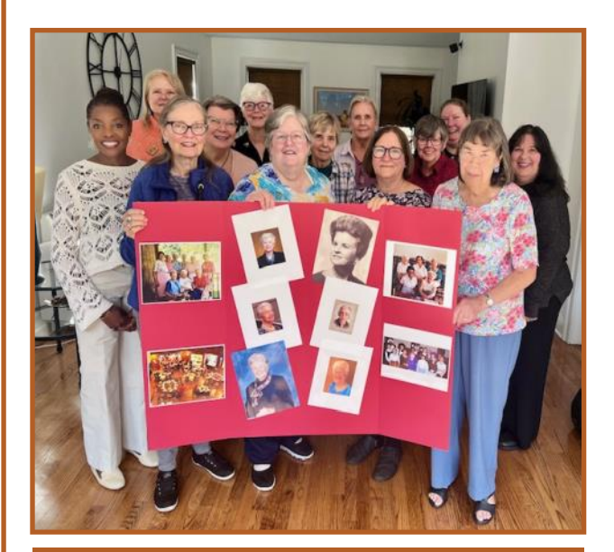
FHS Annual Meeting October 12, 2024