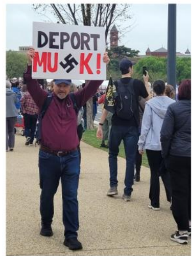
Photos from marches in Wilmington, DE and in Washington, D.C. this spring, 2025